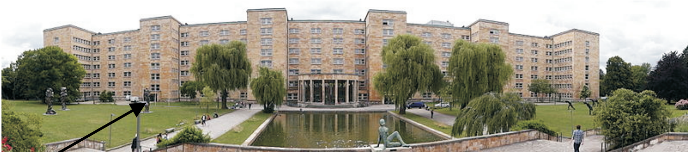
Entrance at the back of the main building.

You will find the Frobenius Institute in the ground floor of the main building, the so called “IG-Farben”, in corridor Q5 (room numbers 511 to 518).