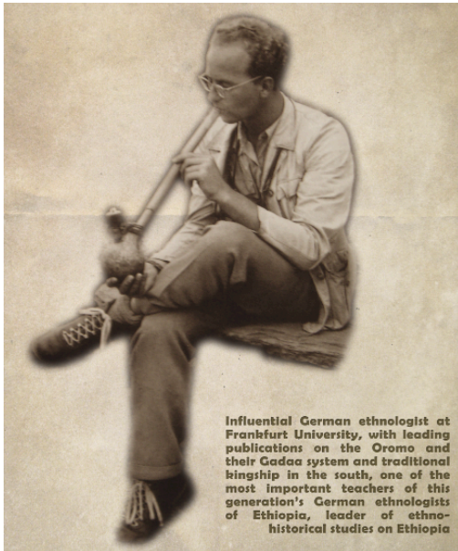
Influential German ethnologist at Frankfurt University, with leading publications on the Oromo and their Gadaa system and traditional kingship in the south, one of the most important teachers of this generation's German ethnologists of Ethiopia, leader of ethno-historical studies on Ethiopia